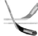
Hockey Stick (mandatory)