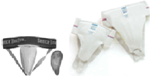
Athletic supporter/male or female (mandatory)